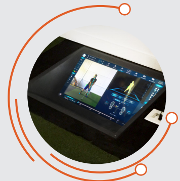
STATE OF THE ART TECHNOLOGY

OFFICE 815.777.4700 | FAX 815.777.1541 | WWW.FIRSTGALENA.COM