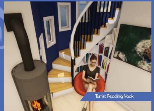
Turret Reading Nook