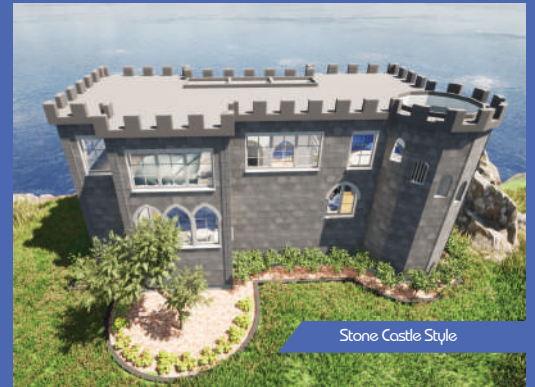
Stone Castle Style

The Castle Mountains , named after the spires of Castle Peaks, captures that iconic look with a stone castle style and a modern style. The Castle Mountains is the presidential suite of Utopian Villas. Want to live in a 400 sq. ft. Villa, but don't want to downsize your wardrobe? The Castle Mountain's full walk-in closet is your solution. The turret is the focal point of the home, with its meticulously designed spiral staircase, circular bookcase and reading nook. Unwind in the reading nook with a good book by the gas fireplace or escape upstairs to the loft with a view. Did we mention that this home sleeps 8 guests?