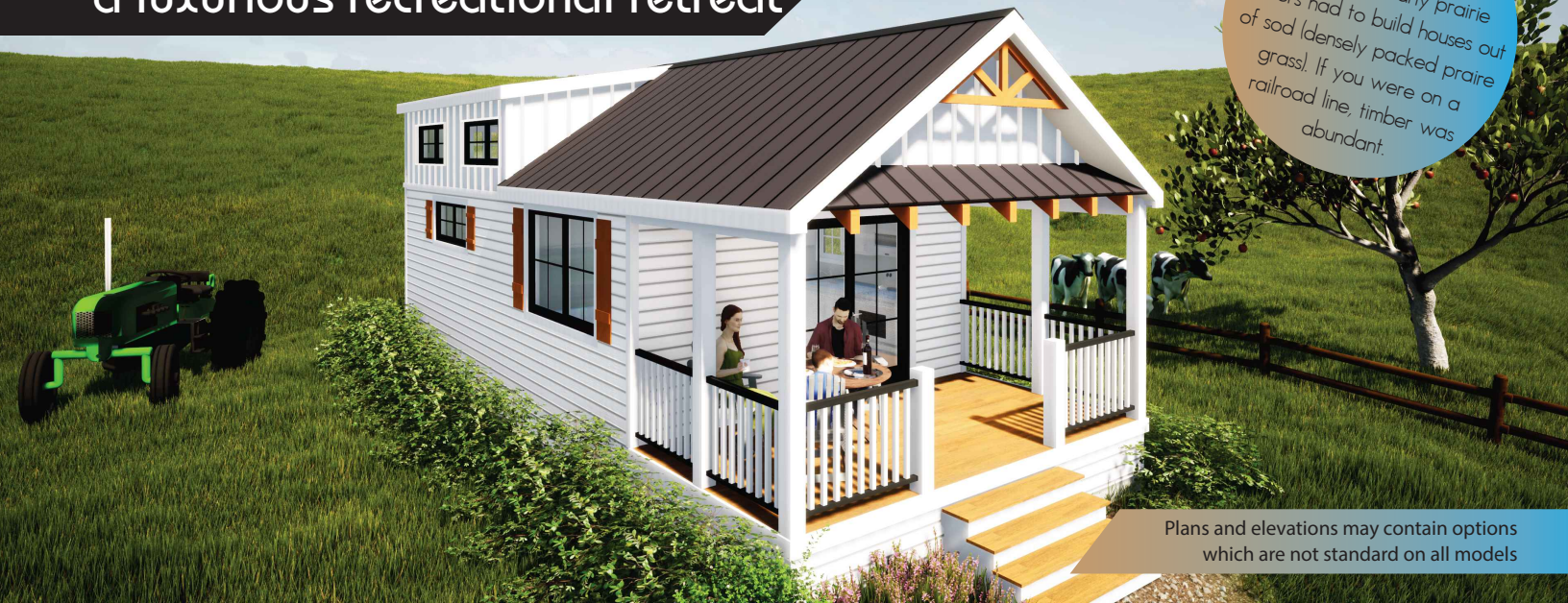
Plans and elevations may contain options which are not standard on all models

Fun Fact Without access to timber or stone, the early prairie settlers had to build houses out of sod (densely packed prairie grass). If you were on a railroad line, timber was abundant.