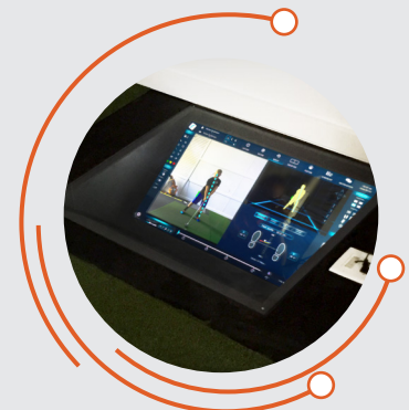
STATE OF THE ART TECHNOLOGY